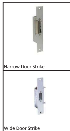
INS Lifeguard - Door Strike